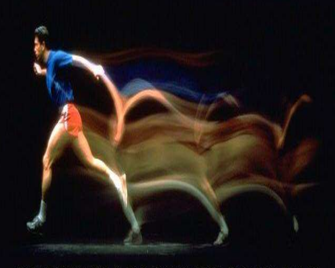
SPORTS DO NOT BUILD CHARACTER. THEY REVEAL IT